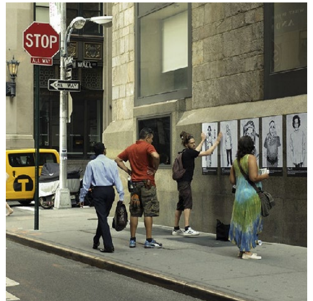
New-York Portraits of americans who participated in Occupy Wall Street, peaceful protest movement against the abuse of capitalism.