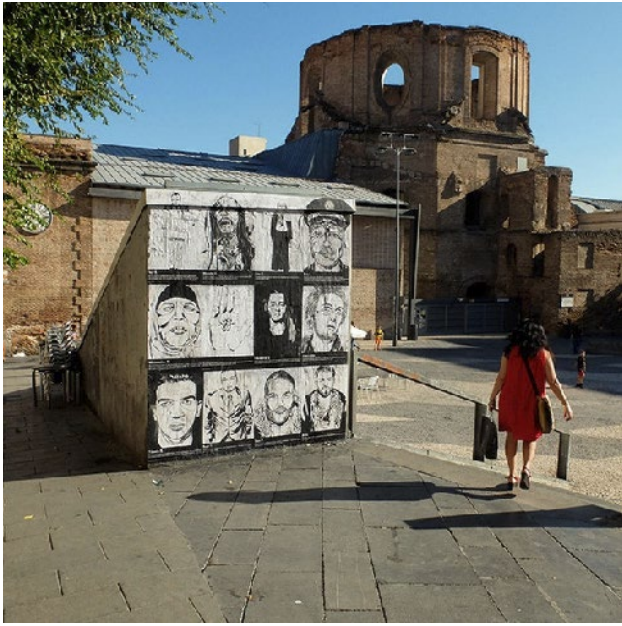
Madrid Spanish protesters who participated in Plaza del Sol indignants movement in 2011, against political system oligarchy and the abuse of economic and financial systems.