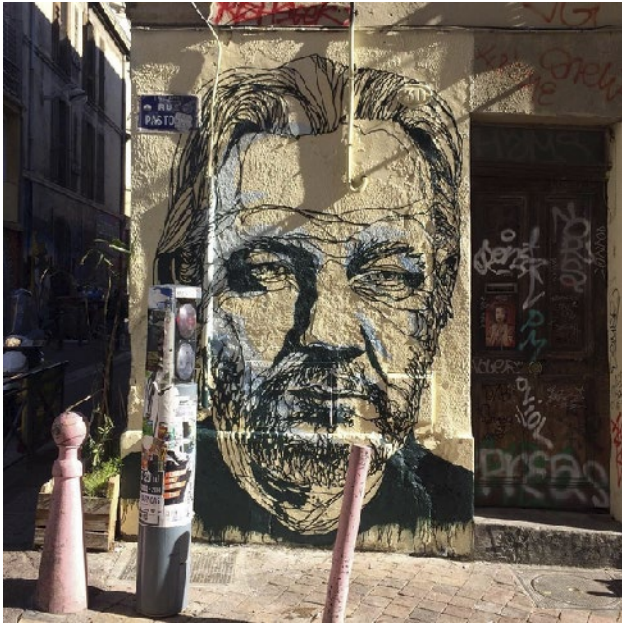
Julien A. Marseille Australian cyberactivist. Founder of WikiLeaks. Remained in Ecuador's London Embassy since June 2012.