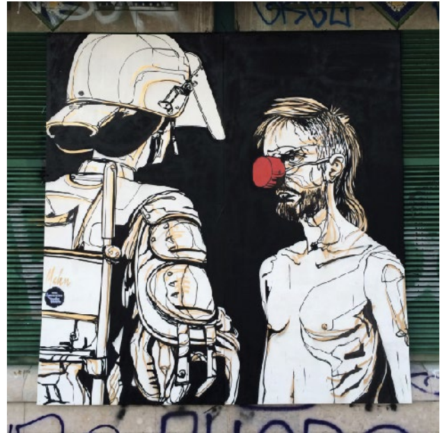
Marseille Tribute to French 'Zadistes' acting on 'Zone to Defend', militant occupation that is intended to physically block a development project often with an ecological or agricultural impact...