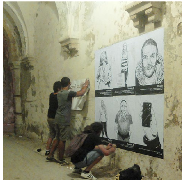
Tunis Tunisian protesters who fought for the departure of the dictator Ben Ali during the Arab Spring in 2011.